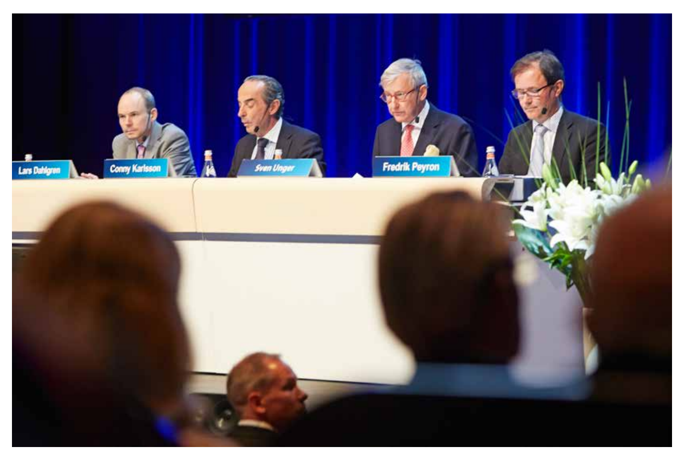
Swedish Match Annual General Meeting 2014.

Members of the Disclosure Committee during 2014 were the heads of Business Control, Investor Relations and Corporate Sustainability, Group Reporting and Tax, as well as Corporate and Legal Affairs.