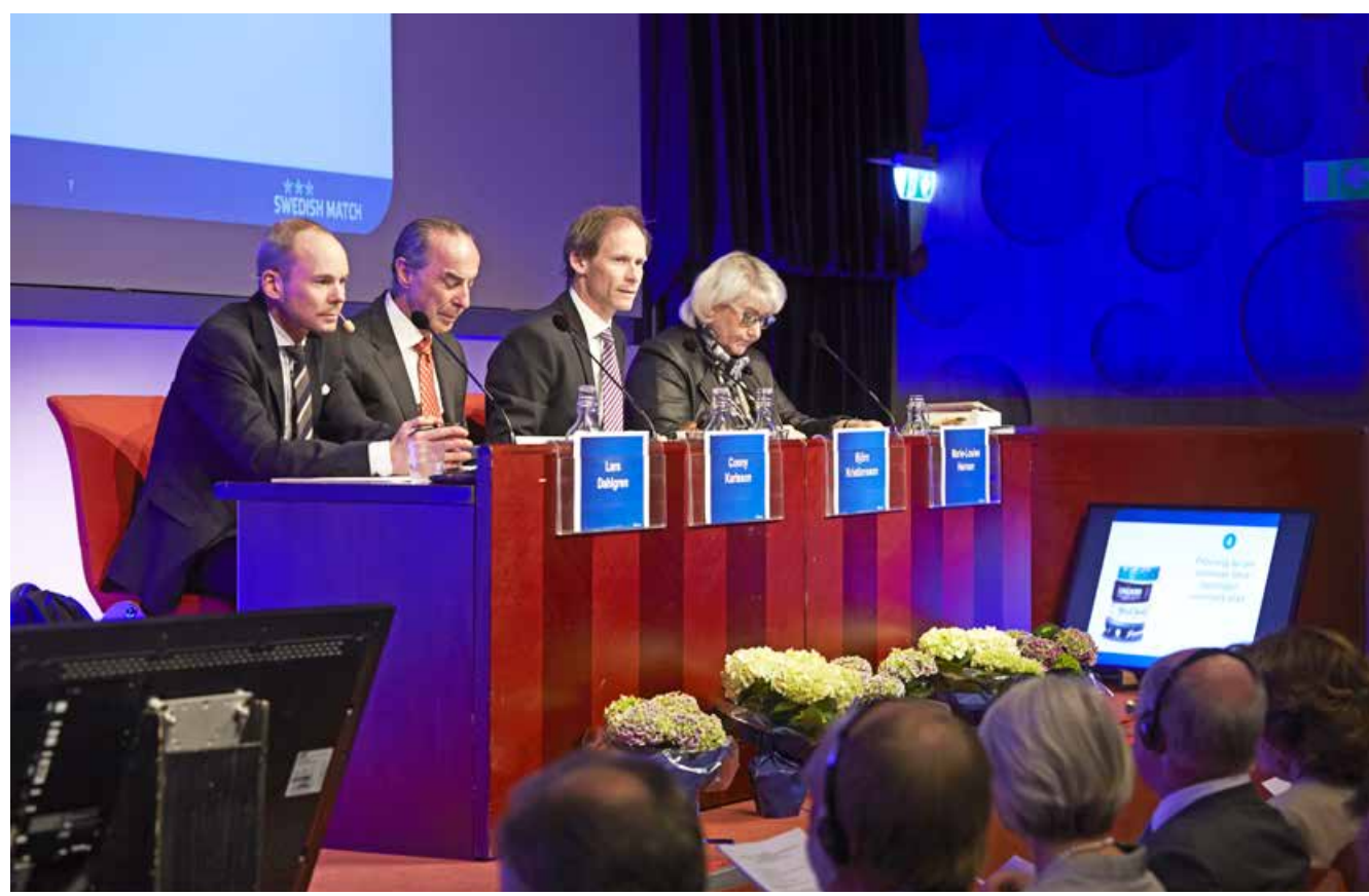
Swedish Match Annual General Meeting 2015.

Members of the Disclosure Committee during 2015 were the heads of Business Control, Investor Relations and Corporate Sustainability, Corporate Control, as well as Legal Affairs.